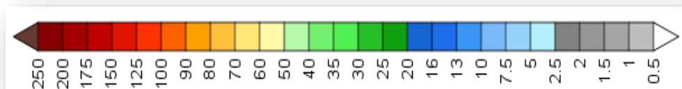
Figure: 2. Precipitation forecast for 28 May to 03 June 2018 (Source: NOAA NCEP).