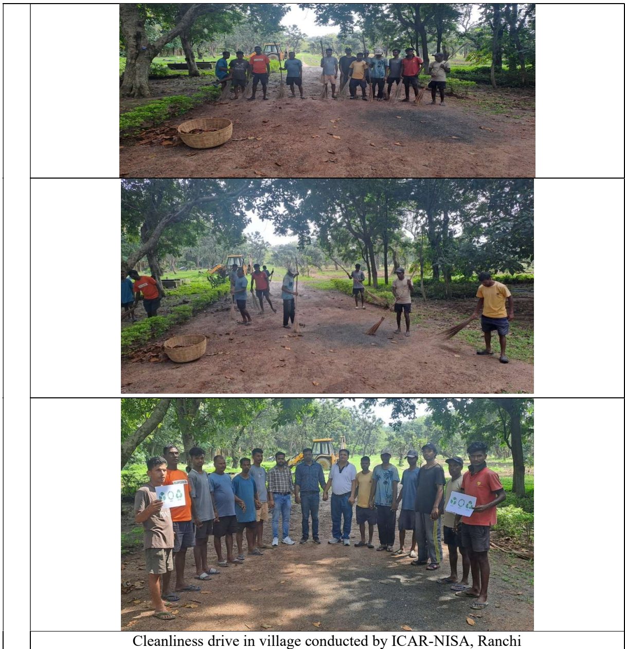
Cleanliness drive in village conducted by ICAR-NISA, Ranchi