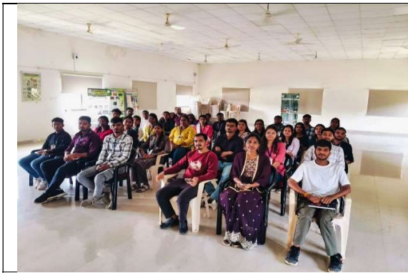
Swacchata awareness lecture