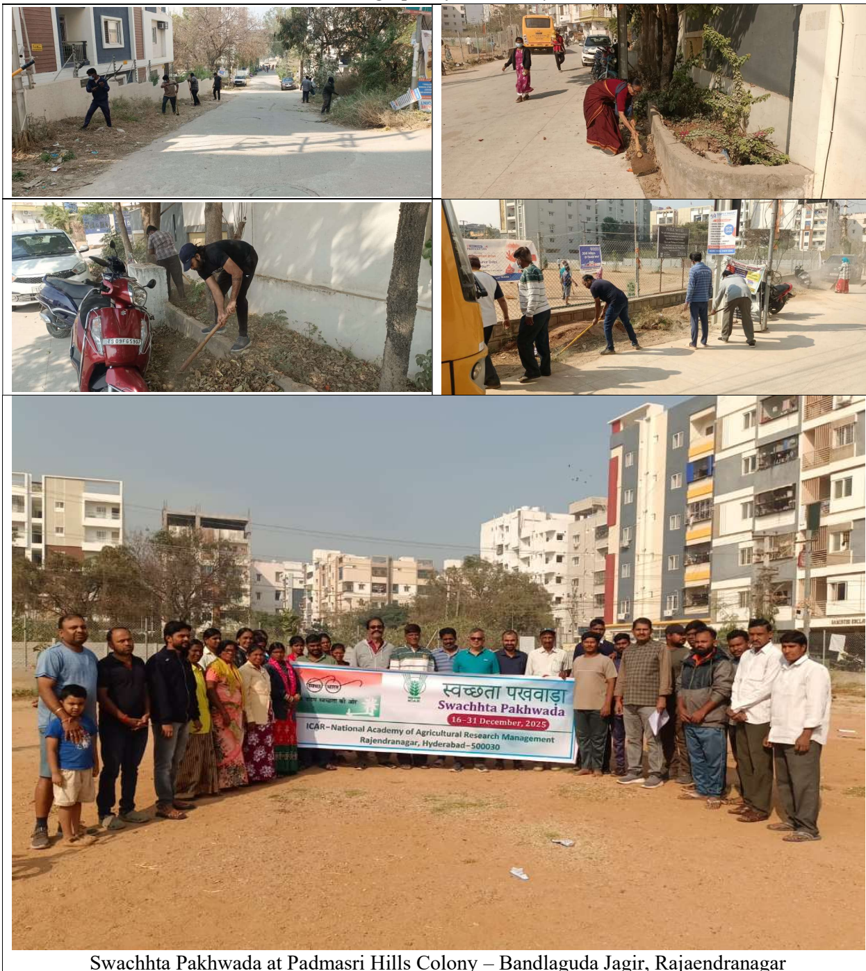
Swachhta Pakhwada at Padmasri Hills Colony – Bandlaguda Jagir, Rajaendranagar