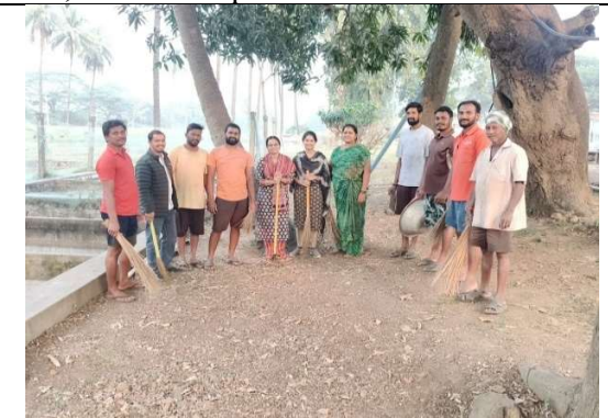
Swacchata Abhiyan at FFFF, Balabhadrapuram