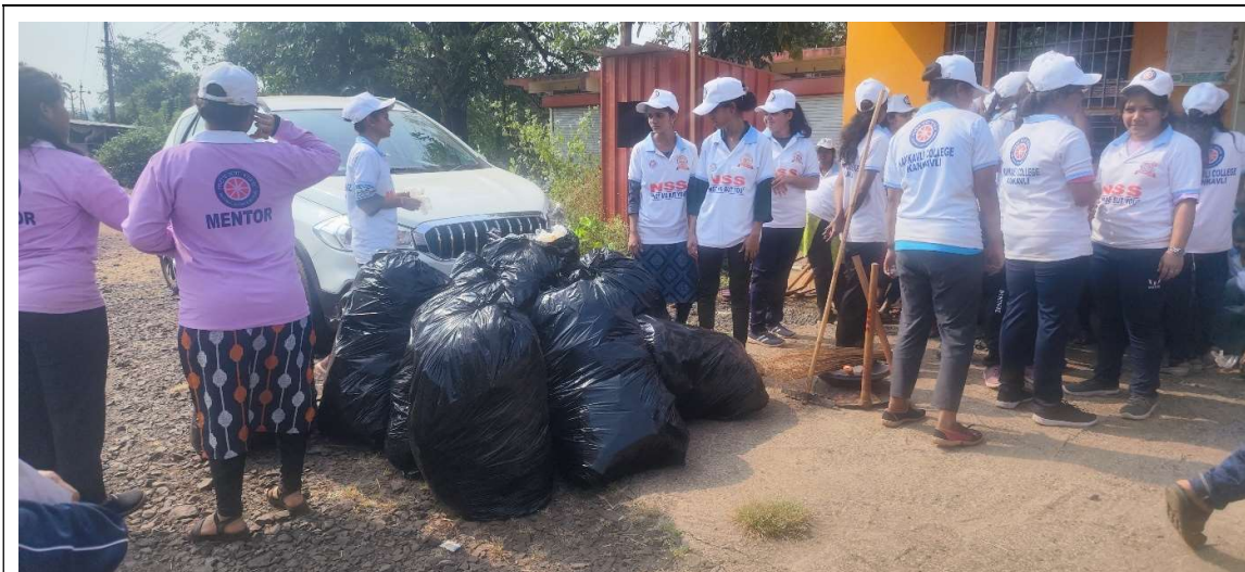
Shraamdaan activities conducted in school near Mumbai and Nagpur