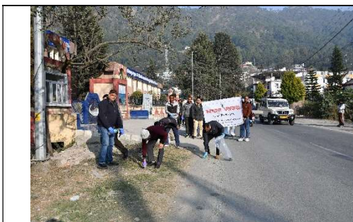
Shramdaan in nearby street of office

Under the swachhta pakhwada activities, shramdaan was organized near the Saras market complex and Vikas Bhawan campus, Bhimtal to promote cleanliness for a healthy and hygienic life. Sales women of the Bakery shop in the Saras Market complex, Bhimtal also took part in the shramdaan activities. The owner of the canteen being run inside the Saras Market also took part in the campaign. Sanitation drive was also organized in the adjoining street of the Vikas Bhawan office complex. The staff members of the institute alongwith the local community participated in the campaign. In another programme under the TSP activities “Karmyogi” VAP (Village Action Plan), a massive swachhta campaign was organized at distant locations in Village Samra and Sirkha Dharchula block, Uttarakhand. Awareness created on maintaining cleanliness in daily lifestyle for a hygienic life. Besides, they were educated on maintaining cleanliness in and around their fish ponds for better yield and to save the livestock from diseases. The farmers actively participated in the programme. The Gram Pradhan of these villages were also present during the campaign. Dr.R.S. Patiyal, Principal Scientist & Nodal Officer TSP and Dr. Rajesh M., Sr. Scientist of the Institute coordinated the programme in the villages of Dharchula block.