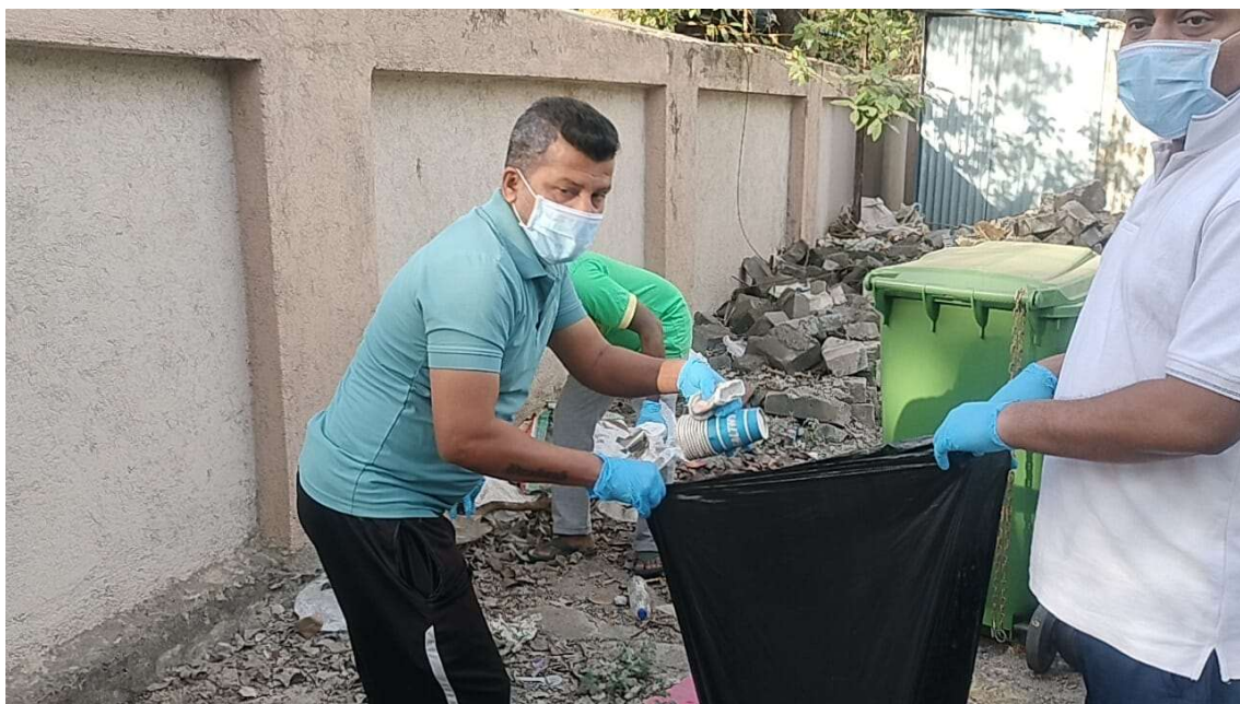
Shraamdaan activities conducted at residential colony, Mahim, Mumbai.