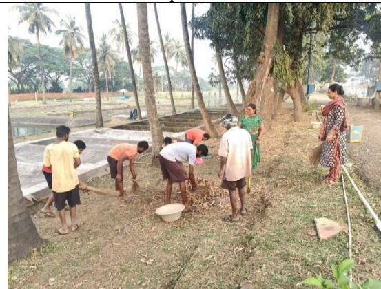
Swacchata Abhiyan at FFFF, Balabhadrapuram