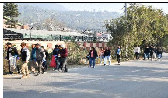
Shramdaan near Vikas Bhawan, Bhimtal