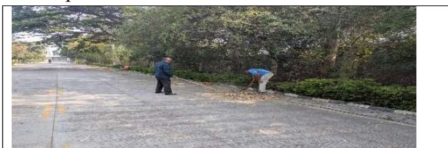
Cleaning the main internal roads and removing accumulated leaf litter and debris from the road

In addition, it was observed that the residents followed proper waste segregation practices during disposal, reflecting increased awareness and adoption of sustainable waste management habits. The enthusiastic participation and disciplined approach of the community highlighted their commitment to cleanliness and environmental responsibility. Overall, the initiative effectively reinforced the objectives of Swachhata Pakhwada and showcased the residents' dedication to maintaining a clean and well-organized campus.