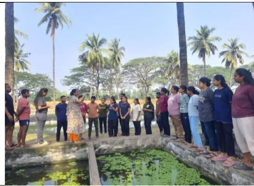
Delivering the importance of swachhata in aquafarms