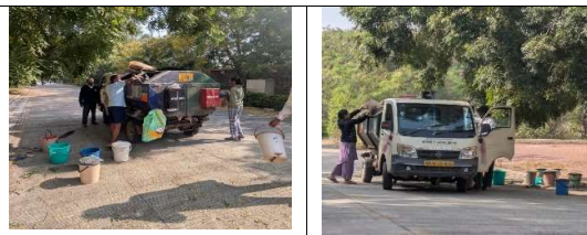
Proper waste segregation practices during disposal