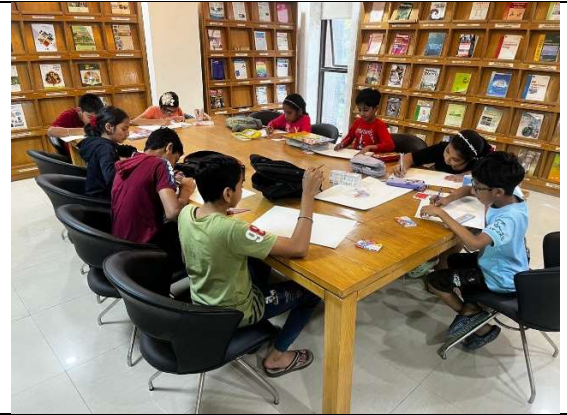
Drawing competition conducted for staff kids on the theme 'Clean River' and 'My Clean Home'