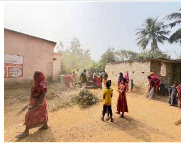
Cleaning in progress