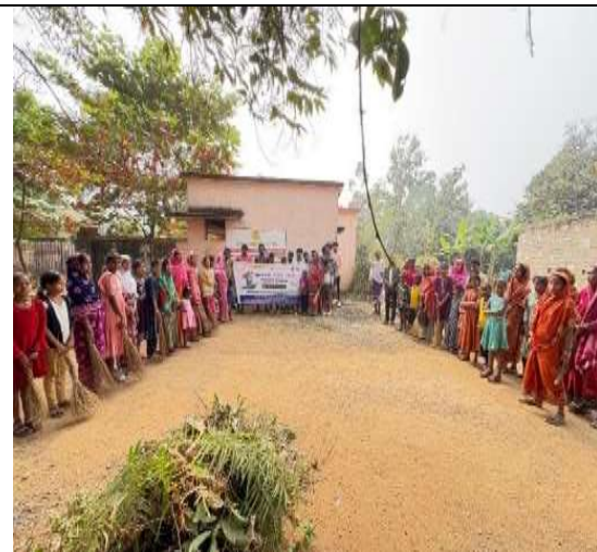
Villagers after cleaning the village road