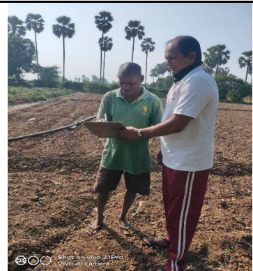
signature campaign near Surat, Gujarat