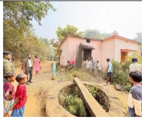
Swachhhta Pledge being administered to the participants

On Day-10 of the on-going Swachhhta Pakhwada i.e., on 25 th December 2025, a Swachhhta programme involving farmers, farmwomen, village youth and school children was organized in Gutpapada village of Jatni block of Khordha district. At the outset, the participants were administered swachhhta pledge and then sensitized about various activities being take up and practices being promoted among people. Participants were informed about waste and plastic management at household level. Villagers were advised to protect trees and nearby ecosystem. Participants were also sensitized about adverse effects of increasing plastic pollution, and were advised to stop burning of garbage and plastics so as to maintain a clean environment. Then all the participants went through the village cleaning the village roads. A signature campaign to gather pledges on Swachhhta was also launched. A total of seventy two (72) villagers participated in the programme and pledged their support to Swachhhta. Some of the photographs of Day-10 are presented below.