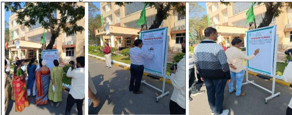
Campaign on Cleanliness, and sanitation through Signature

As a part of Swachhta Bharat Mission, ICAR-Central Research Institute for Dryland Agriculture organizing Swachhta Pakhwada from 16 to 31 st December 2025 . As per the action plan, the Swachhta Pakhwada activities were implemented on 25 th December 2025 and the staff members of ICAR-CRIDA participated at CRIDA main office. ICAR-Central Research Institute for Dryland Agriculture (CRIDA), Hyderabad, organized a Campaign on Cleanliness and Sanitation through Signature as part of its Swachh Bharat initiatives. The initiative aimed to spread awareness, inspire behavioral change, and secure a collective pledge among staff to maintain cleanliness and proper sanitation practices both in the workplace and in their communities. The staff, actively participated by signing a pledge board. The campaign not only fostered awareness but also reinforced a sense of shared responsibility. The campaign generated wide awareness and strengthened CRIDA's commitment to a clean and green environment.