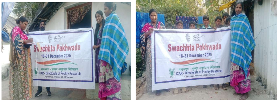
Signature campaign among village women on Swachhata awareness

ICAR-DPR organised a signature campaign among village women on sanitation at Hanuman Nagar, Rajendrangar Mandal, Hyderabad. Swachhata awareness was created in the selected area with the help of women and youth in the area. The area was not adopted under any scheme of the institute.