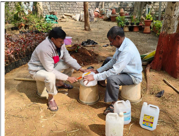
Cutting of the plastic boxes