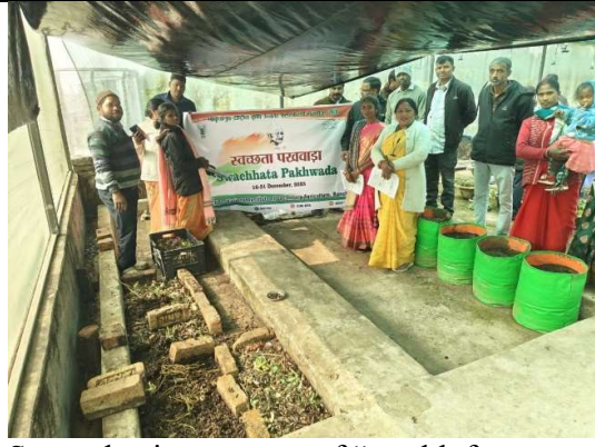
Strengthening concept of "wealth from waste" among rural households through practical demonstration