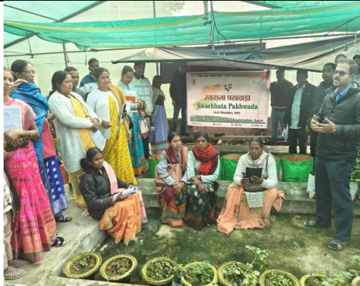
Explaining farmers regarding use of compost in agriculture and kitchen gardens