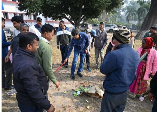
Framers participation in Mobilization for Plastic Waste through Shramdaan