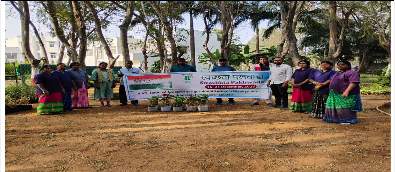
Group Photo at the Nursery