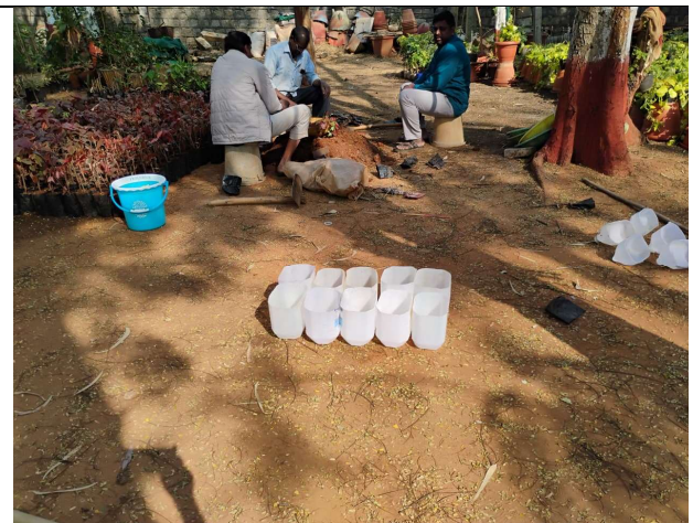
Preparation of plastic boxes for the plantation