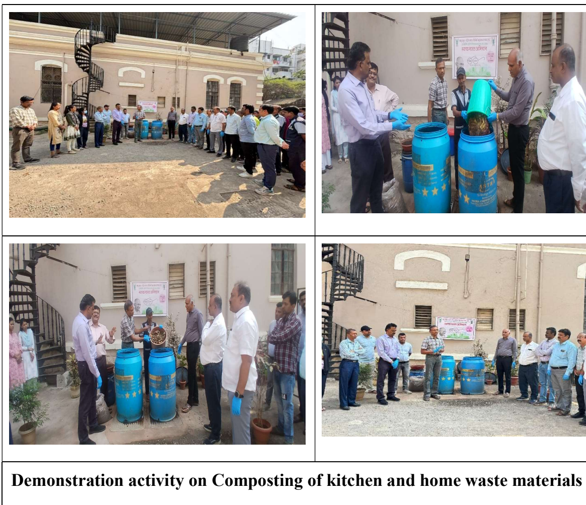
Demonstration activity on Composting of kitchen and home waste materials