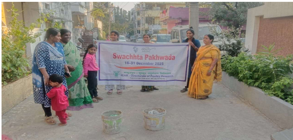
Public of Budwel village educated on curbing single use plastic and segregation of home waste

Awareness was created among the public of Budwel village, Rajendranagar Mandal, Hyderabad on solid waste management. They were educated on the impact of use of single use plastic on the environment and advised to reduce/avoid use of plastic. Further, they were also appraised on the importance of segregation of waste and advantages of composting of the kitchen waste.