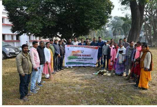
Group photo after Shramadaan with the community participated in Shramadhan at ICAR-NISA, Ranchi