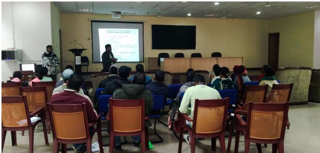
Awareness programme on Waste management