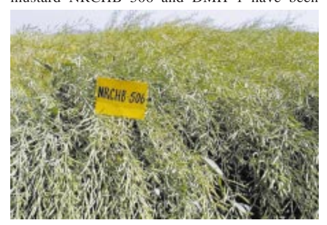
NRCHB 506 Indian mustard hybrid

Rapeseed-mustard: Two hybrids of Indian mustard NRCHB 506 and DMH 1 have been