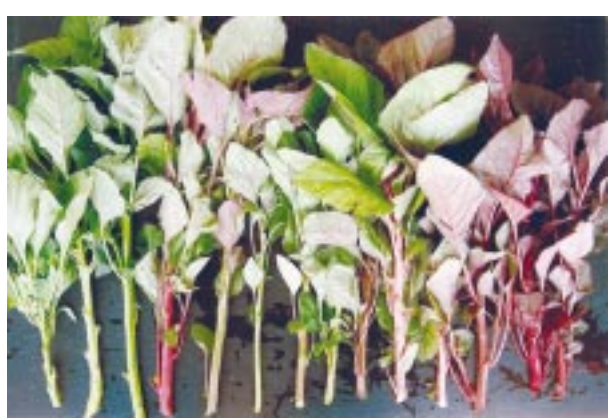
Grain-amaranth has been identified for release in rabi in Rajasthan, Orissa, Jharkhand and Gujarat

Underutilized crops: Grain-amaranth RM 4 and GA 3 have been identified for release for