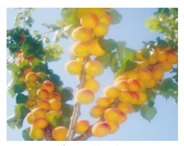
KS-1, a promising apricot

Apricot: Ten promising apricot genotypes were evaluated under medium-density accommodating 400 trees/ha. Four varieties were found promising under Kashmir conditions. CITH selection KS 1 (8.0 tonnes/ha) gave the maximum yield followed by Harcot, AS 1 and AS 2. The TSS of these elite varieties ranged from 13.87 to 15.98° Brix, indicating their suitability for table purpose.