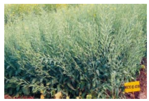
NRCYS 05-02 yellow sarson variety

identified for release. Similarly, 7 varieties of rapeseed-mustard have been identified for release for various agro-ecologies of the country. These are ONK 1 (Gobhi sarson), NRCYS 05-02 and YSH 0401 (Yellow sarson), RB 50, RGN 145, NRCHB 101 and LESI 27.