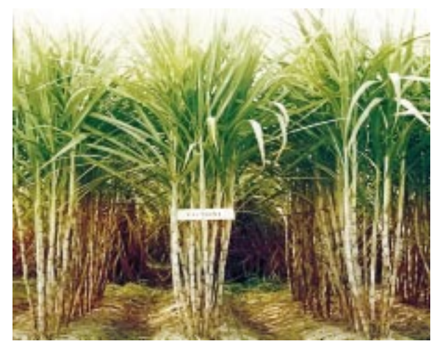
CoLk 94184 (Birendra) has been recommended for commercial cultivation. It withstands moisture stress and waterlogging in eastern Uttar Pradesh and Bihar

Sugarcane: Among red-fleshed clones, NG 77 75 recorded appreciably higher antioxidants than the other tested clones.