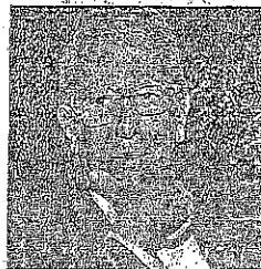
Sir David King, UK's Special Representative on Climate Change

King, who was previously the British government's Chief Scientific Advisor, is leading a team of British companies who have come here to showcase their pro-